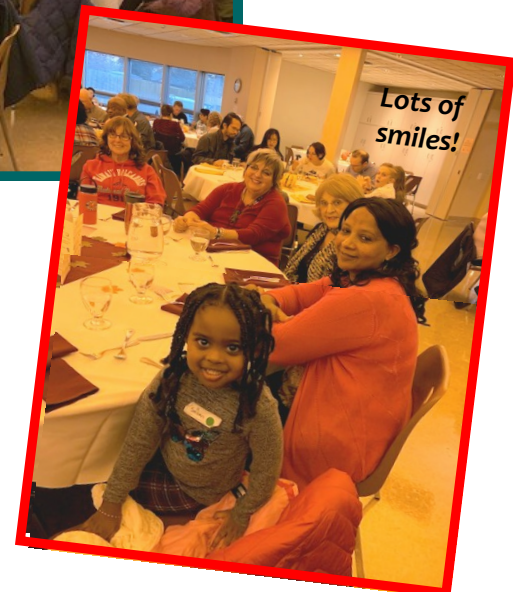
Lots of smiles!