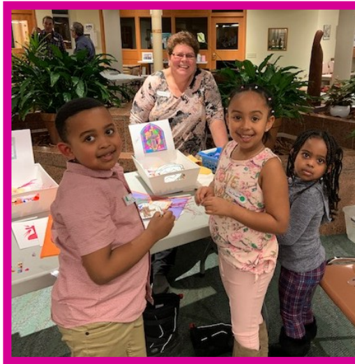
"Saintly" crafts for the kids!