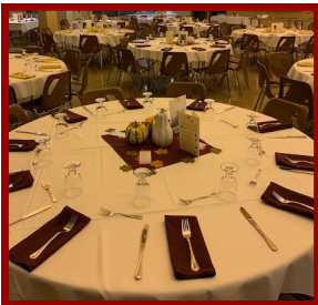
Thank you to Quintex for use of the lovely table linens!